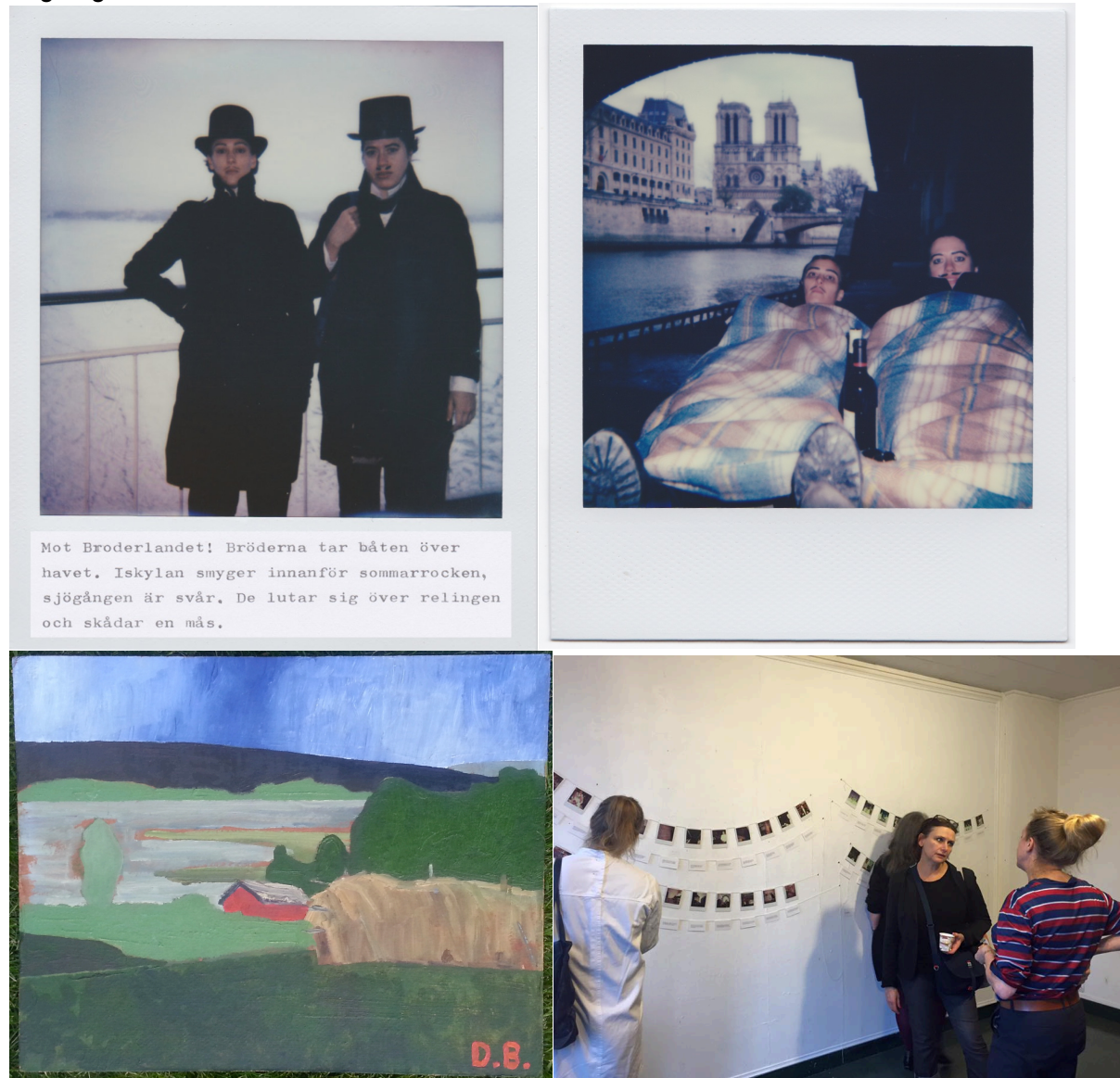
Höbal i förgrund Dryckesbröderna -15

ongoing collaboration with Sonia Hedstrand since 2013