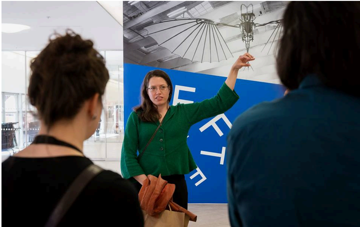
Documentation of a Poetry Workshop on June 27, 2015 at Moderna Museet Stockholm.